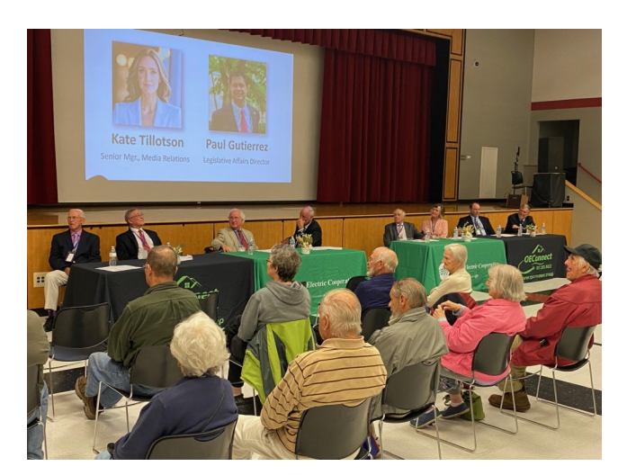
Board and CEO