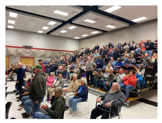
Honoring our Veterans!

Never attended a meeting but curious about it? Give us a call and we would be happy to explain why it's an important piece of being a Cooperative member with us.